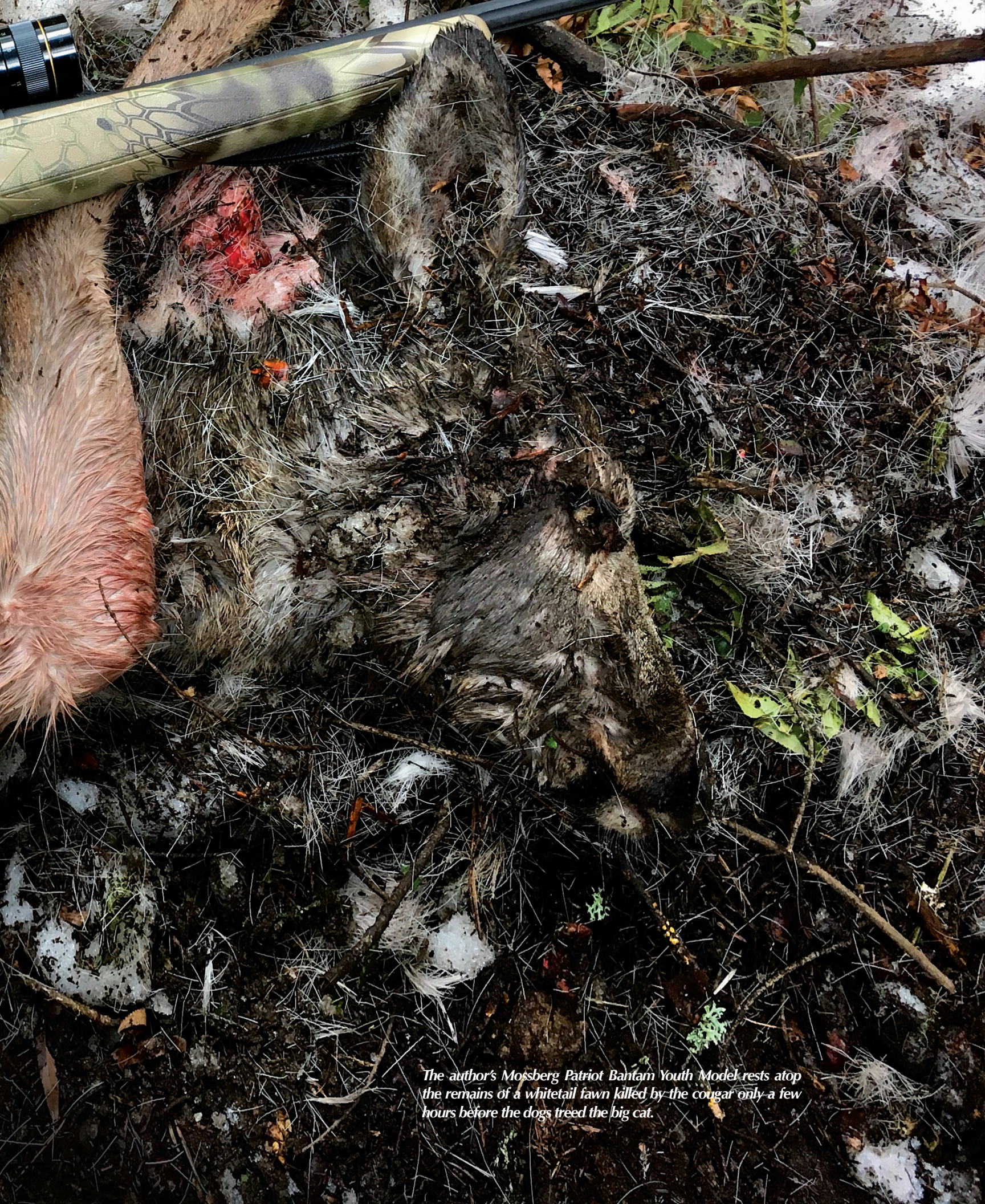
The author's Mossberg Patriot Bantam Youth Model rests atop the remains of a whitetail fawn killed by the cougar only a few hours before the dogs treed the big cat.