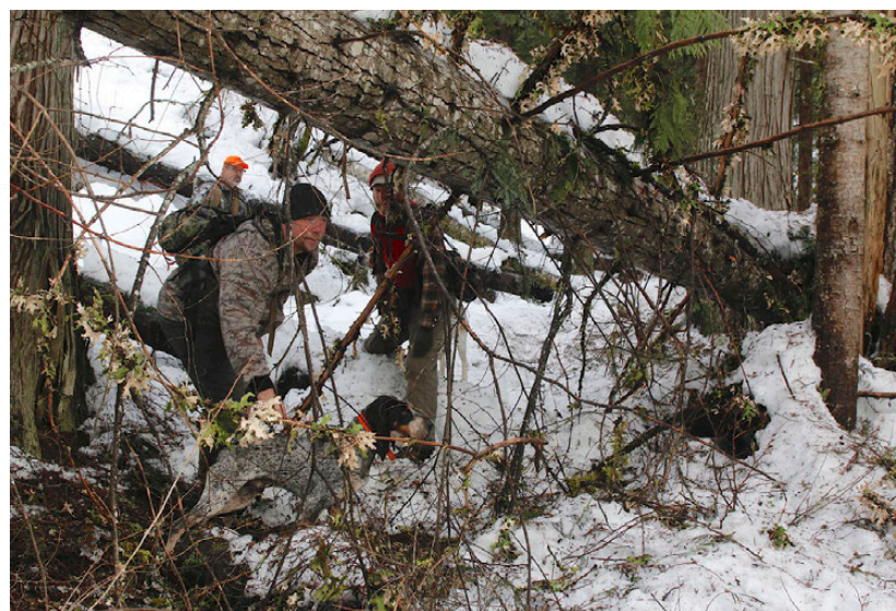
Closing in on the cat, the hunters and dogs had to contend with deep snow, massive windfalls and thick tangles of brush.