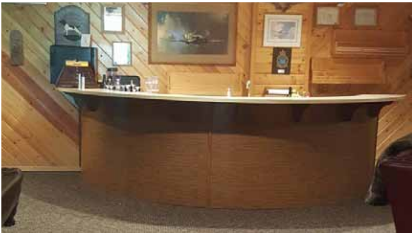
Above: The original small, rounded bar prior to renovation. Below: The new L-shaped blued pine custom bar with added seating so even more can join in the conversation.

That dear old relic is gone and the new bar is ready and waiting for you. It's big, inviting, and a great place for making new memories... much like the Flying B Ranch itself. Not only will guests this Fall enjoy appetizers and drinks around this new beauty, but they can enjoy more bar seating for quality conversation and more big screens for watching their favorite team.