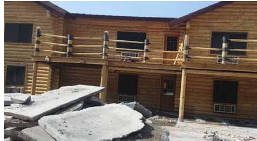
Above Top: Old patio beside the untreated logs on the exterior of lodge after corn-blasting and installation of the new roof, just prior to staining and sealing. Above Bottom: Demo day on the old concrete patio.

The renovations to the outside were even greater. We corn blasted and refinished the log exterior as well as replaced the old tile roof with a lightweight metal roofing. Where guests will see the most changes outside is in the patio itself with an all new concrete patio ideal for morning coffee and evening bonfires under the stars.