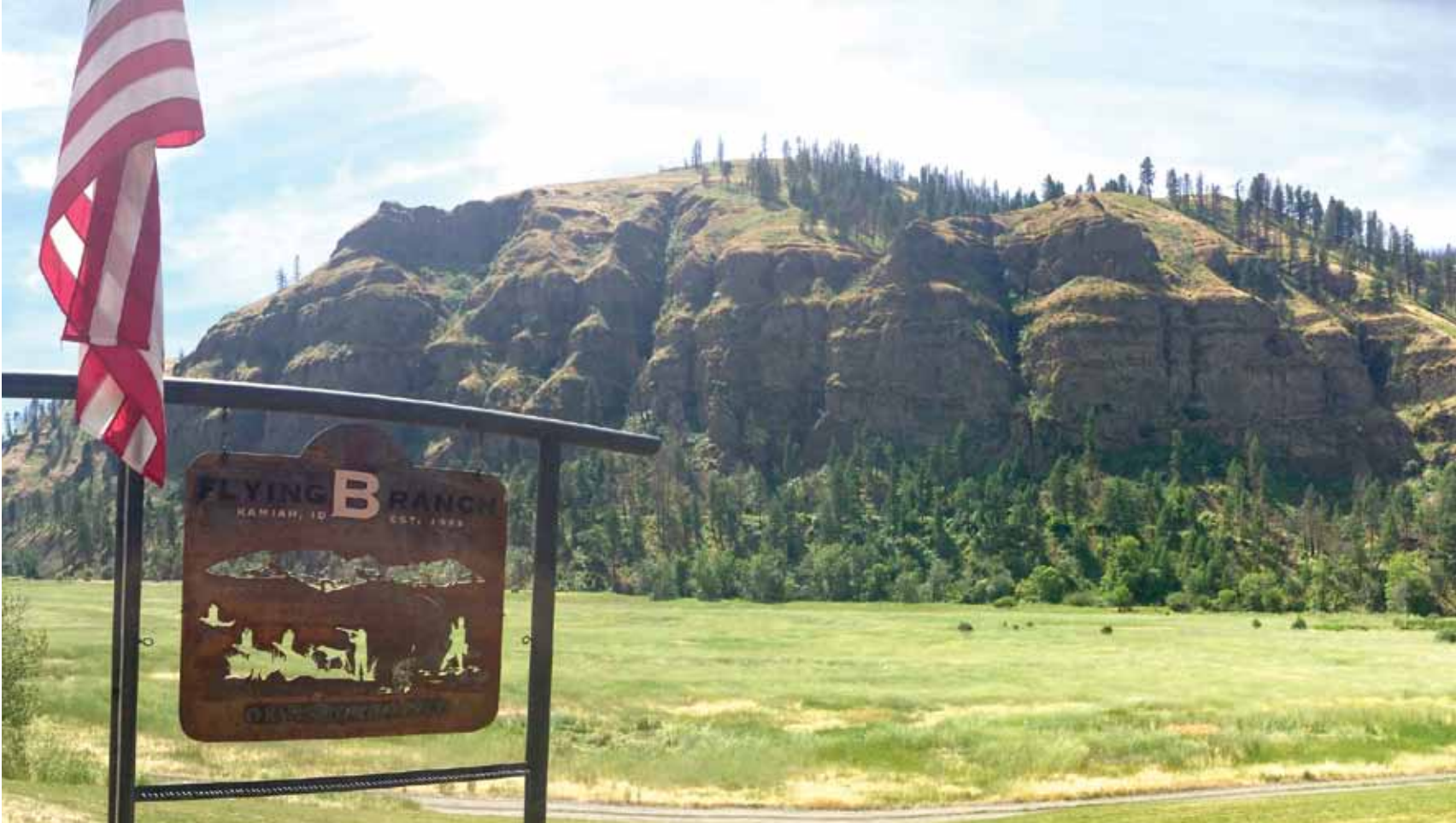
Above: Lawyer Canyon view from our new locally crafted steel lodge sign. Below Left: Check your life-stresses at the curb if you are meeting one of our new fleet vehicles at the airport. Below Right: Completed patio featuring new hot tub and sauna with the same unforgettable views to look forward to.